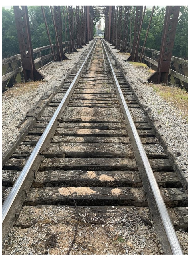
(247.4-1 Thru Truss w/Open tie deck)